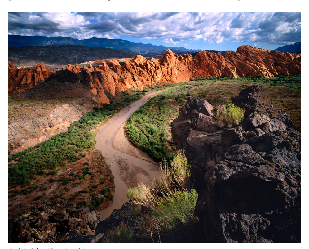
Little Babylon

Another important step in our ongoing responsibility is to earn official accreditation from the Land Trust Alliance, the organization that provides small land trusts such as VRLPA with guidance and a strong, unified voice for land conservation standards and practices. The accreditation process is demanding, but will be well worth it, giving VRLPA public recognition for professionalism and reliable long-term protection of lands in the public interest.