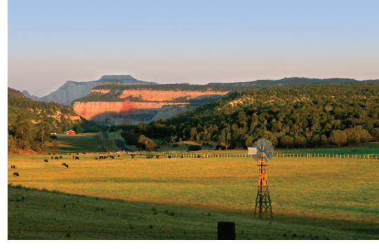
East Zion, Photo: Zion Mountain Ranch