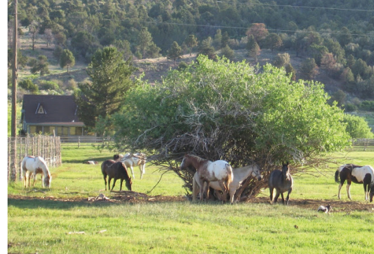
Pine Valley Meadows

Confluence Park land purchases, and the Pine Valley Meadows easements.