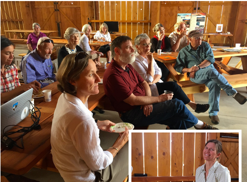
Annual Members' Meeting, photo: VRLPA